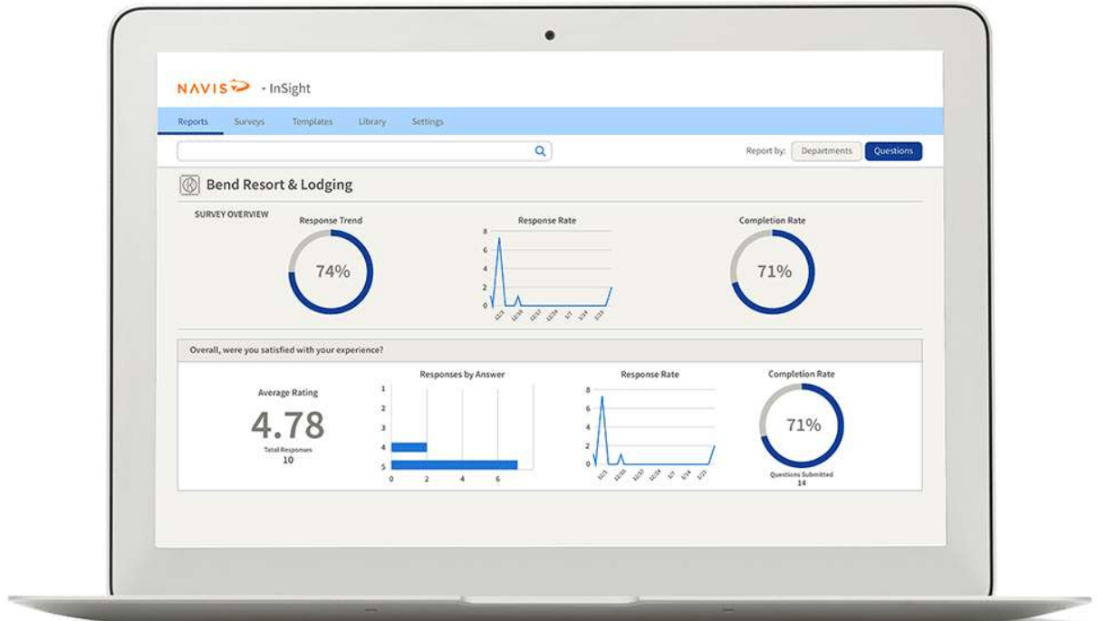
Survey responses leveraged for marketing segmentation and personalization